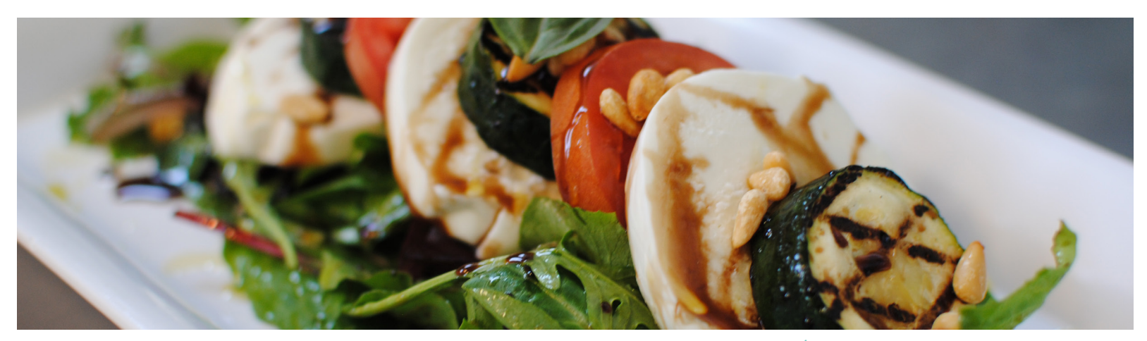
All salads $14.50 per person unless noted Bottled Water or Canned Soda $1.75